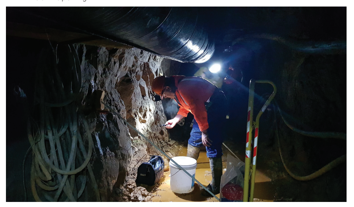
Figure 4 - Seismic Survey testing

A key risk to this work programme is the potential occurrence of unknown excavations in the area. In order to quantify and mitigate these risks the company has aligned with ATS, a local company to investigate the possibility of deploying digital electro seismic mapping underground to identify possible extensions of the vein systems within the mine and to assist with the mapping of unknown excavations. A beta test of the technology application for the Talisman mine is underway and results have shown promise. This technology is traditionally used for aquifer mapping, but an initial test has indicated that the system can potentially be adapted to work in the underground environment. A detailed test regime was developed to enable seismic readings to be correlated with known features identified in exploration boreholes which will allow the equipment to be calibrated to interpret the Talisman Mines geological environment. If successful, this innovative approach will greatly assist with identifying exploration opportunities and aid mine planning.