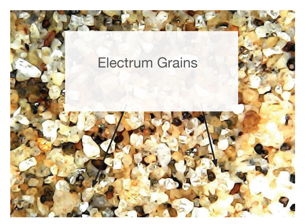
Phase 1 of the metallurgical testwork has successfully achieved commercial recovery rates of optimal grind size of the equipment. Whilst improving on those results is of importance the primary focus of phase 2 is test work on the outputs of metals concentrate, bullion and sand processed from the ore (which can be used in a variety of building and civil works applications) with the data from further batches processed through the pilot plant forming the basis for the higher volume plant design consent and construction.